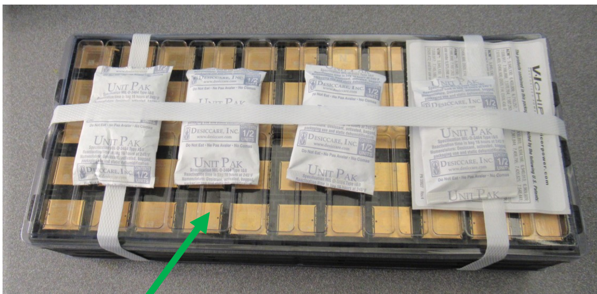
Image of ESD Vacuum Formed Plastic Packaging being implemented.