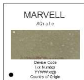
With Marvell Name