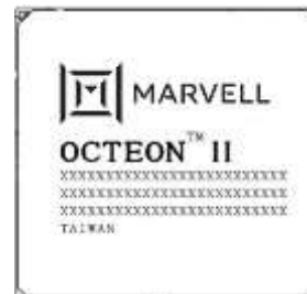
With New Marvell Logo