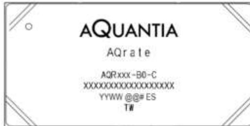
With Aquantia Logo