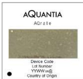
With Aquantia Logo