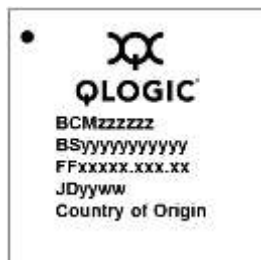
With QLogic Log