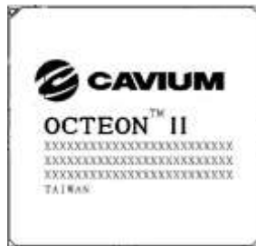
With Cavium Logo