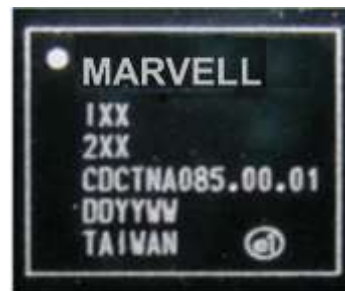
With Marvell Name