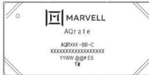
With New Marvell Logo