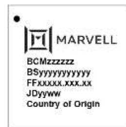
With New Marvell Logo