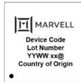
With New Marvell Logo