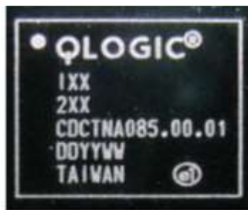
With QLogic Logo